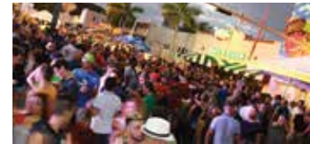
Gay8 Festival Feb

For exact dates, websites and additional information, please go to VisitMiamiLGBTQ.com