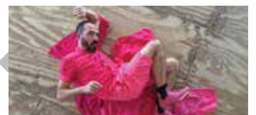
Out in the Tropics May/Jun