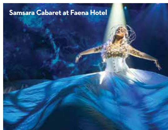
Samsara Cabaret at Faena Hotel

Decide the vibe that your group is feeling, then check out our list at VisitMiamiLGBTQ.com . You can customize your search to easily find any needs.