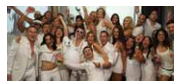
White Party Nov