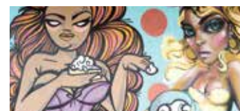
Celebrate Orgullo Oct