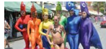
Miami Beach Pride Apr