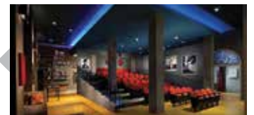
OUTshine Film Festival Apr