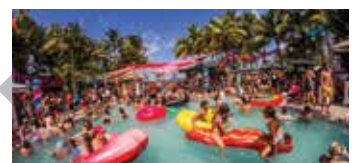
Aqua Girl Sep/Oct