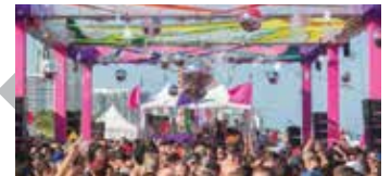
Winter Party Festival Feb/Mar