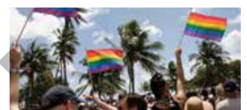
Hialeah Pride Oct